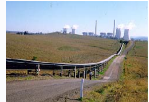
Long Distance Conveying